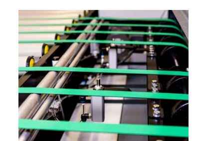
PlateLink 46-XR has a simple belt drive configuration for easy and secure plate transportation.