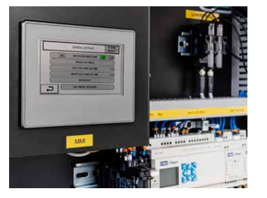
Supplied with a touch screen display for easy configuration and set up.

PlateLink 46-XR must be connected to a compressed air system to function.